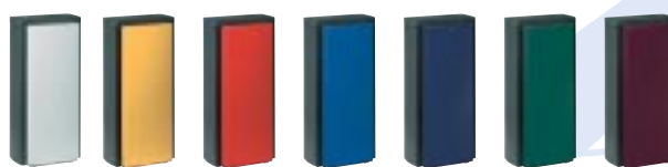
winter grey desert yellow sunset red day blue night blue sea green autumn red